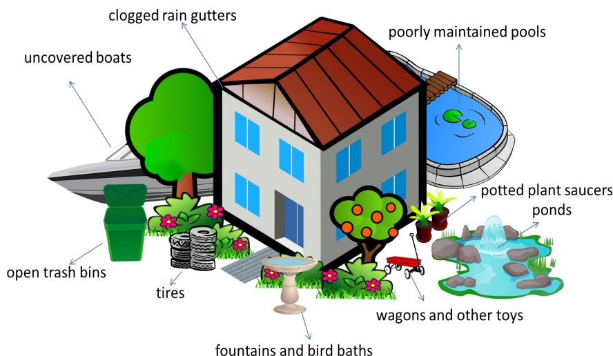
Figure 2. Common backyard mosquito sources.