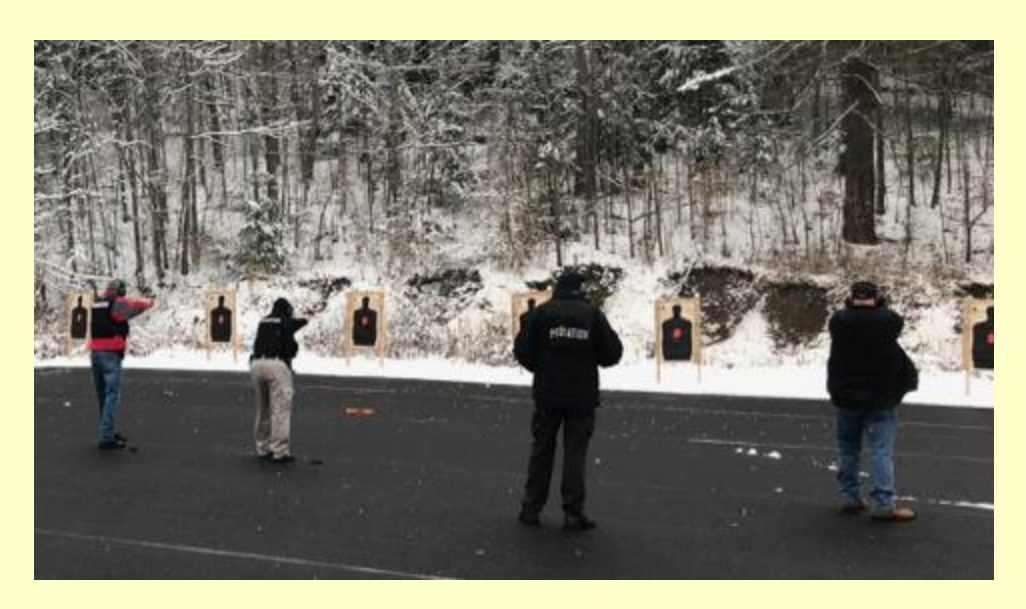
Cattaraugus County Probation Officers complete refresher training in firearms and use of force at the Dempsey Club in Olean in December 2019.

All new hires have been mandated to be similarly trained and equipped, and all Officers will receive annual refresher training in firearms, weapons retention, handcuffs and OC spray, and defensive tactics.