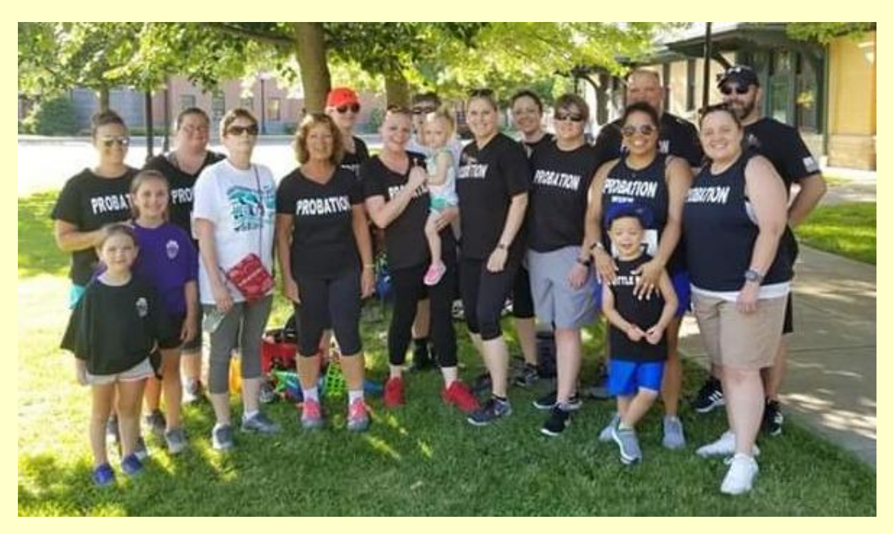
Several Officers and other personnel participated in the 2019 Southern Tier Corporate Challenge 5K run, walk, and food drive, raising money for the Olean Sports Booster Club and donating over 100 boxes of cereal to the Olean Food Pantry.

The Probation Department continues to maintain a pro-social presence within the community it serves.